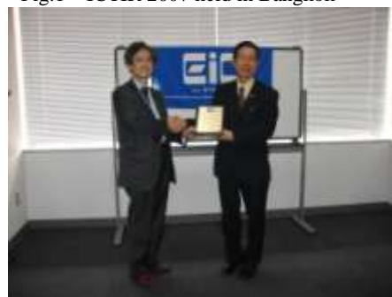
Fig.2 IEICE Overseas Meeting 2007