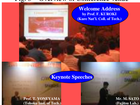
Fig. 4 Welcome Address and Keynote Speeches