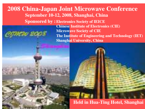
Fig. 3 Overview of Conference venue

Planning for the next CJMW, which will probably be held in Tianjin or Guilin, China, is now under way. We are looking forward to seeing you at the next CJMW in 2010.